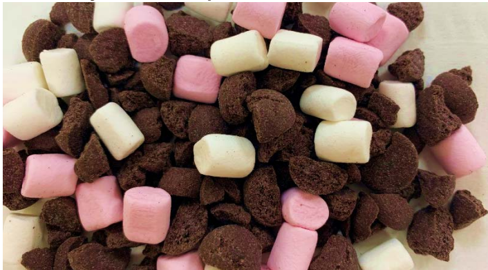
Crunchy and soft pieces