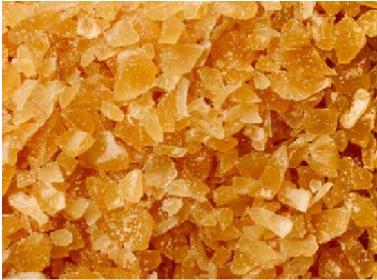
Caramel pieces Saltycaramel