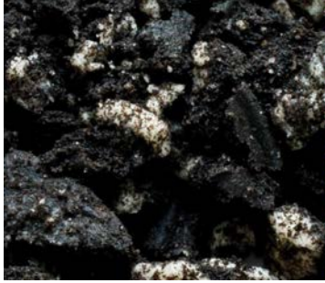
Cookies & cream