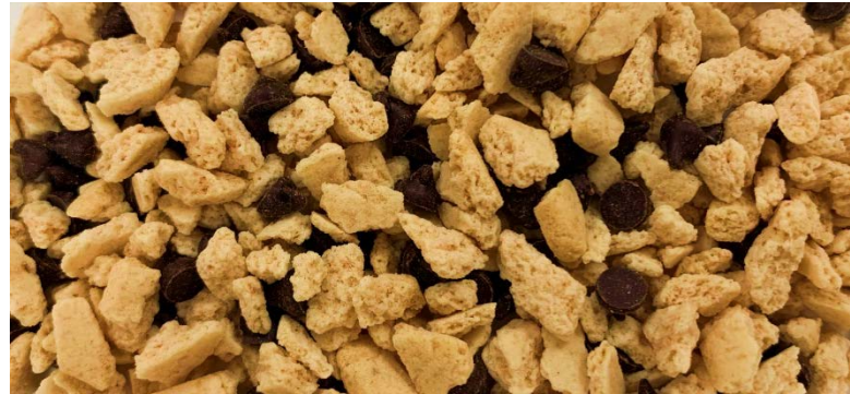
Different biscuit pieces combination