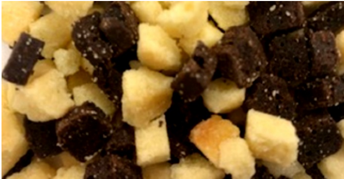
Different frozen cakes combination