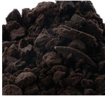
Dark biscuit pieces